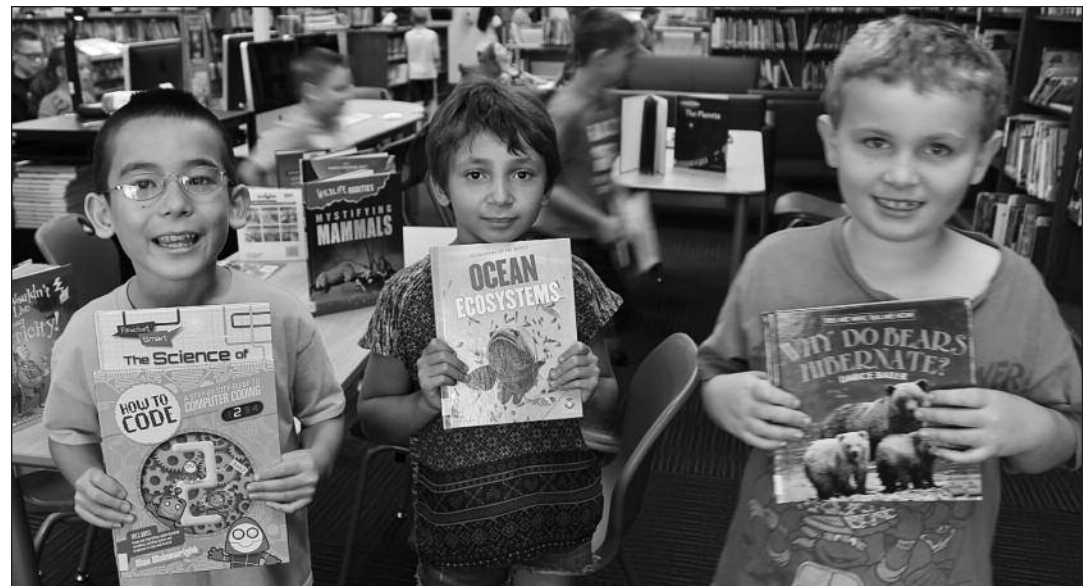
This year, nearly 300 new titles were added to the library collection at Cairo-Durham Elementary. Most of the new items are non-fiction to support curriculum, and students have been excited to read about topics such as science, weather, outer space and computer coding. Read more inside!

The May 16 ballot will contain additional propositions for the Board of Education election and bus purchasing. Residents will be asked to elect three (3) candidates to fill school board vacancies. Residents will also vote on the purchase of five (5) buses as part of the District's board-approved replacement plan.